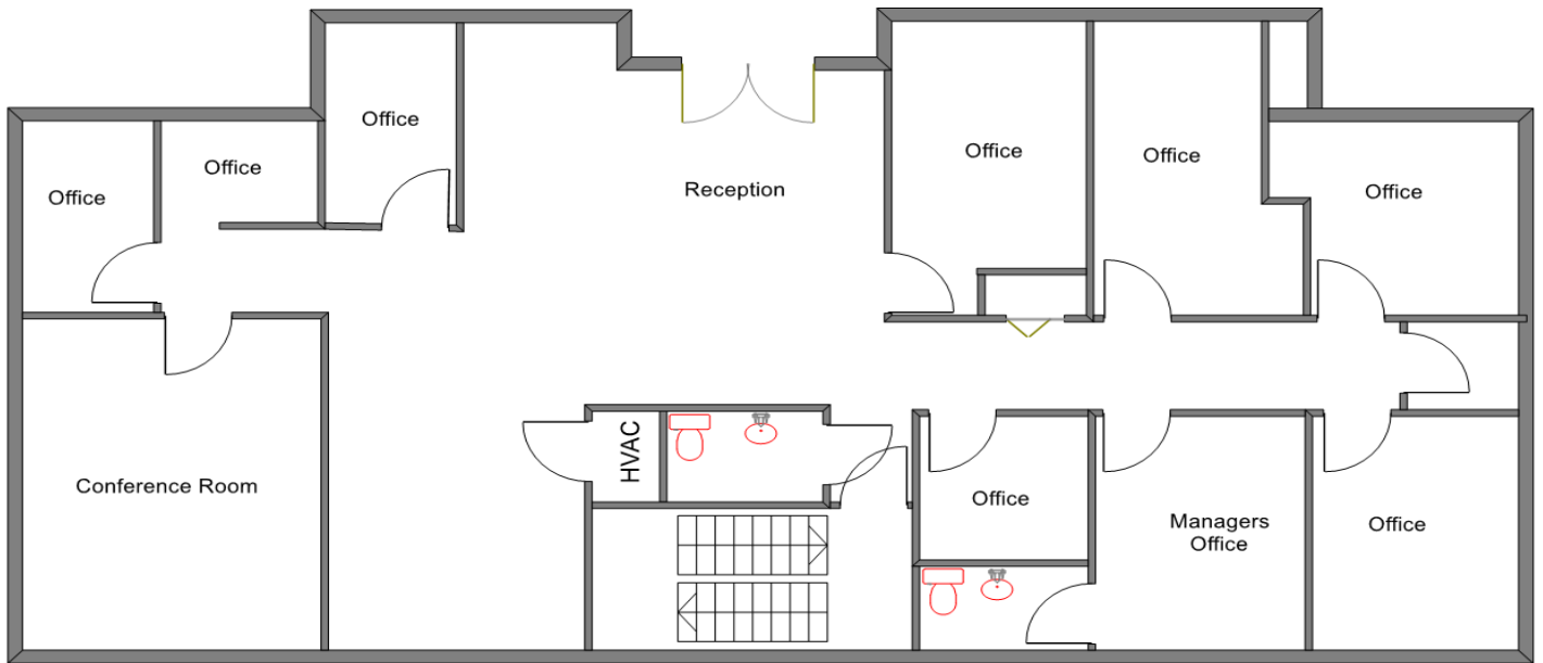
1st Floor Not To Scale