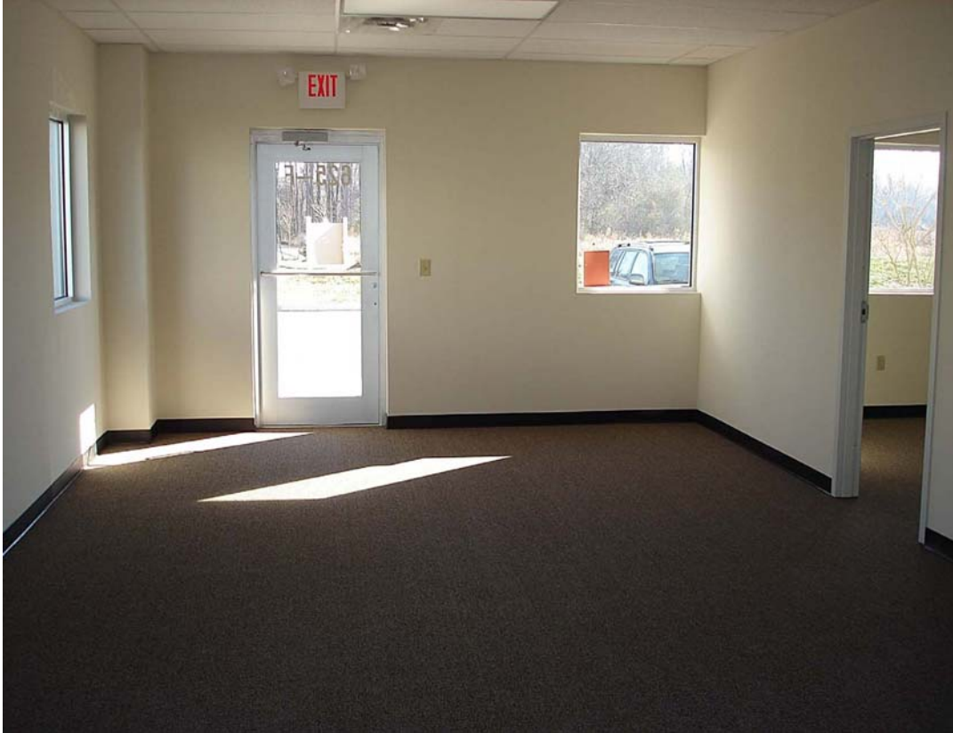
Unit F Office Build Out