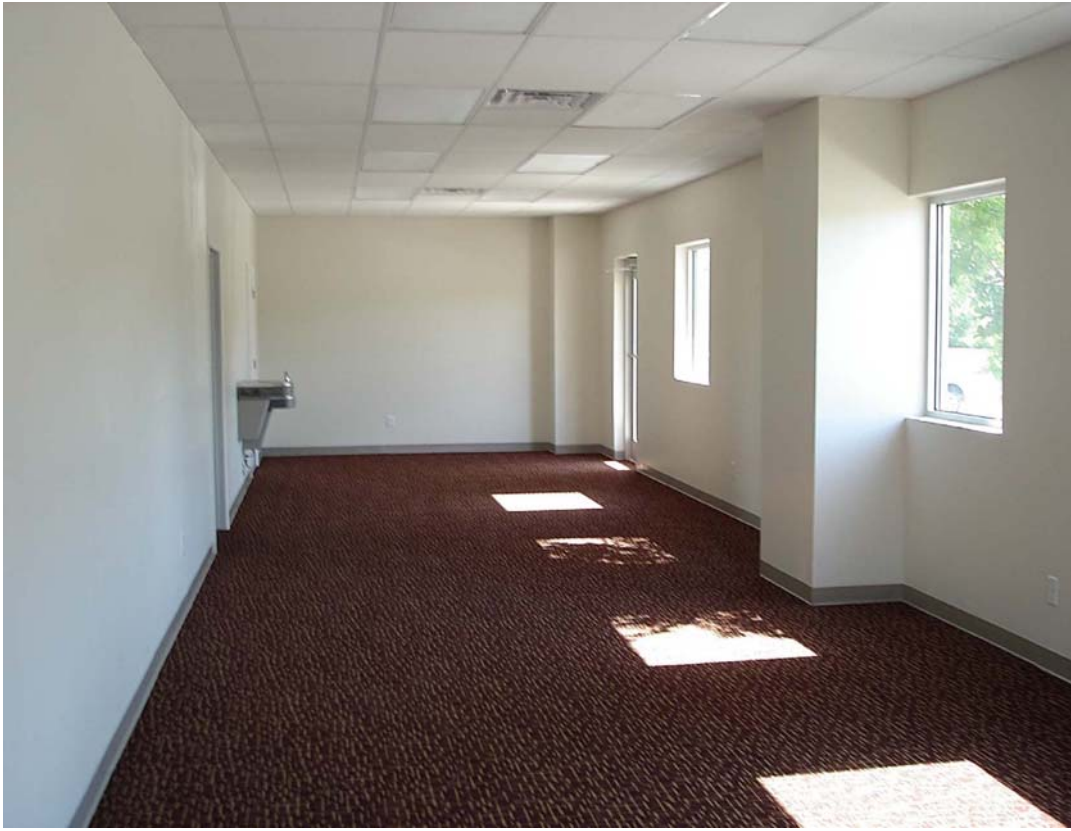
Unit A/B Office Build Out